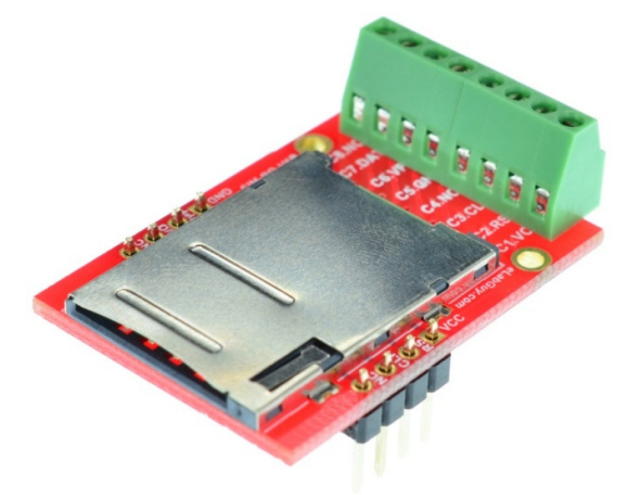
Figure 3: SIM-BO-V1B (PUSH-PUSH type)